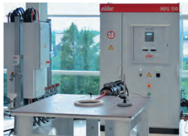
eldec MFG 150 generator with brazing bench and short-circuiting ring brazing inductor