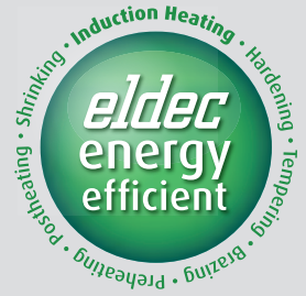
CUSTOM-Line MF 5x8 for induction brazing